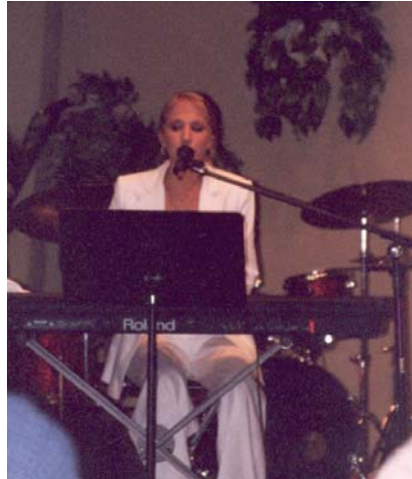
Steph at keyboard during concert